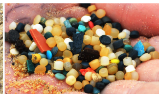
NUMBER OF NURDLES: