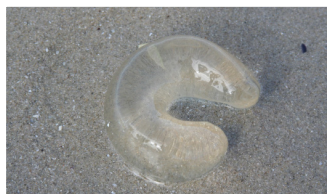
NUMBER OF SAND SNAIL EGG MASSES: